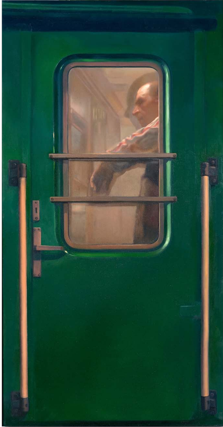
"Wagon H", 2009 oil on canvas 71 x 37 inches (180 x 94 cm)