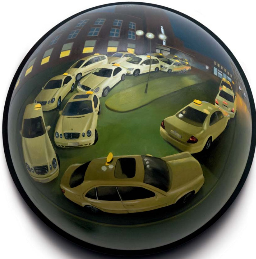
"Taxi Stand", 2009 oil on plastic 20 6/8 x 20 6/8 x 10 1/2 inches (52,5 x 52,5 x 26,5 cm)