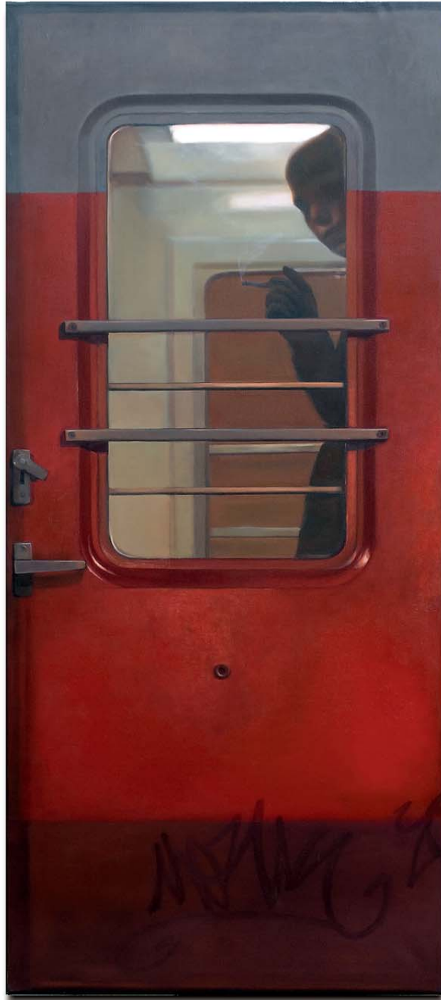
"Wagon K", 2009 oil on canvas 71 x 31 1/2 inches (180 x 80 cm)