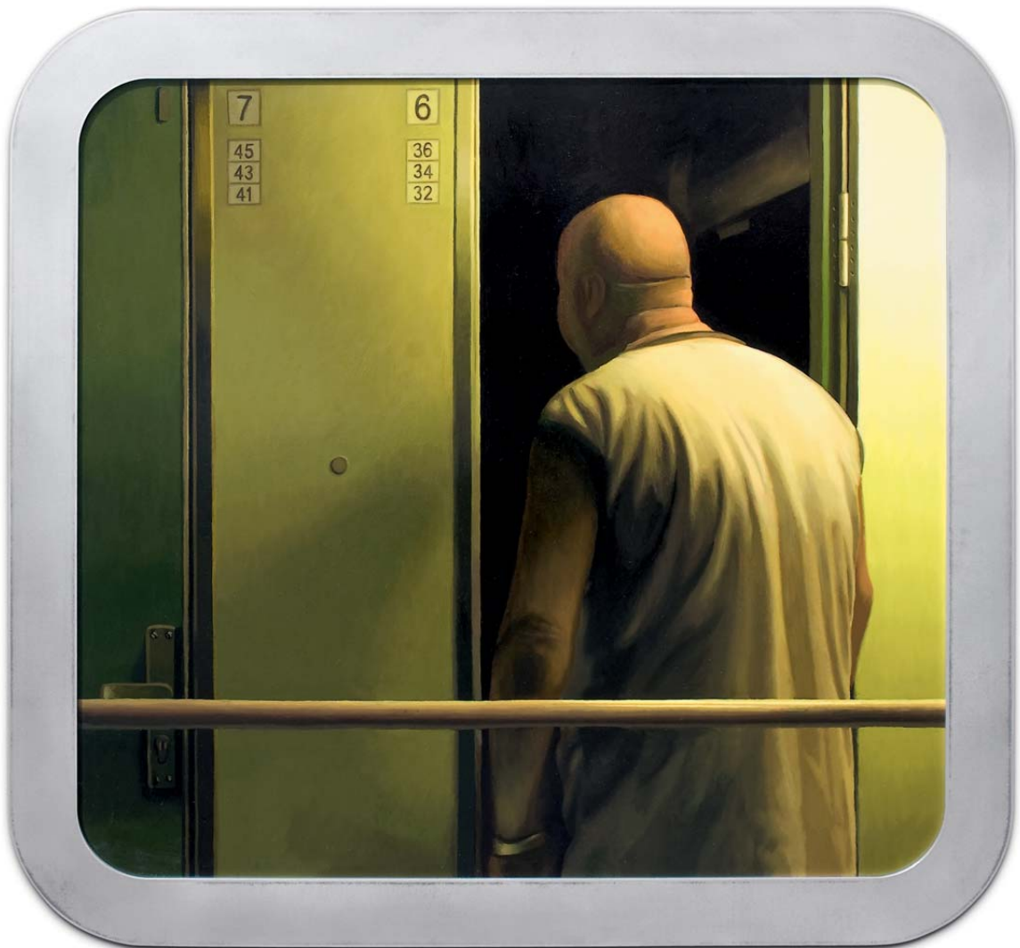
"G - 182/4" , 2009 oil on dibond, aluminium frame 40 1/8 x 43 inches (102 x 109 cm)