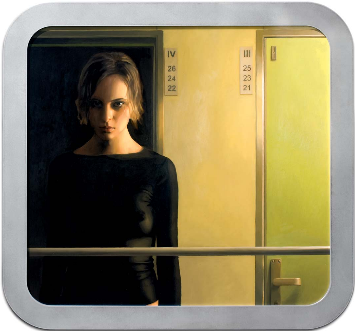
"G - 182/16" , 2009 oil on dibond, aluminium frame 40 1/8 x 43 inches (102 x 109 cm)