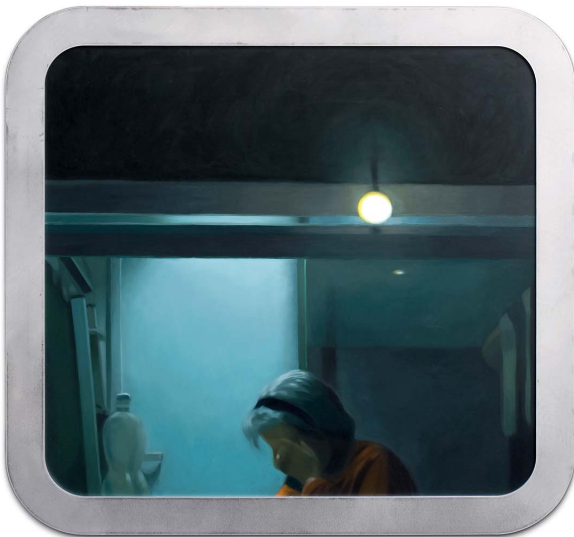
"G - 182/6" , 2009 oil on dibond, aluminium frame 40 1/8 x 43 inches (102 x 109 cm)