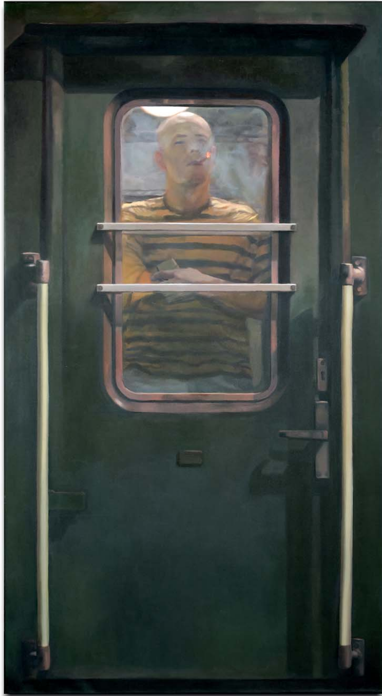
"Wagon D", 2009 oil on canvas 71 x 39 3/8 inches (180 x 90 cm)