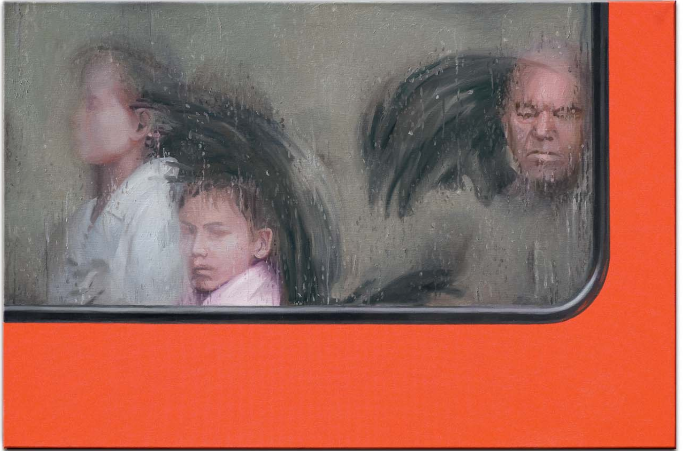
"Rain", 2009 oil on canvas 47 2/8 x 31 1/2 inches (120 x 80 cm)