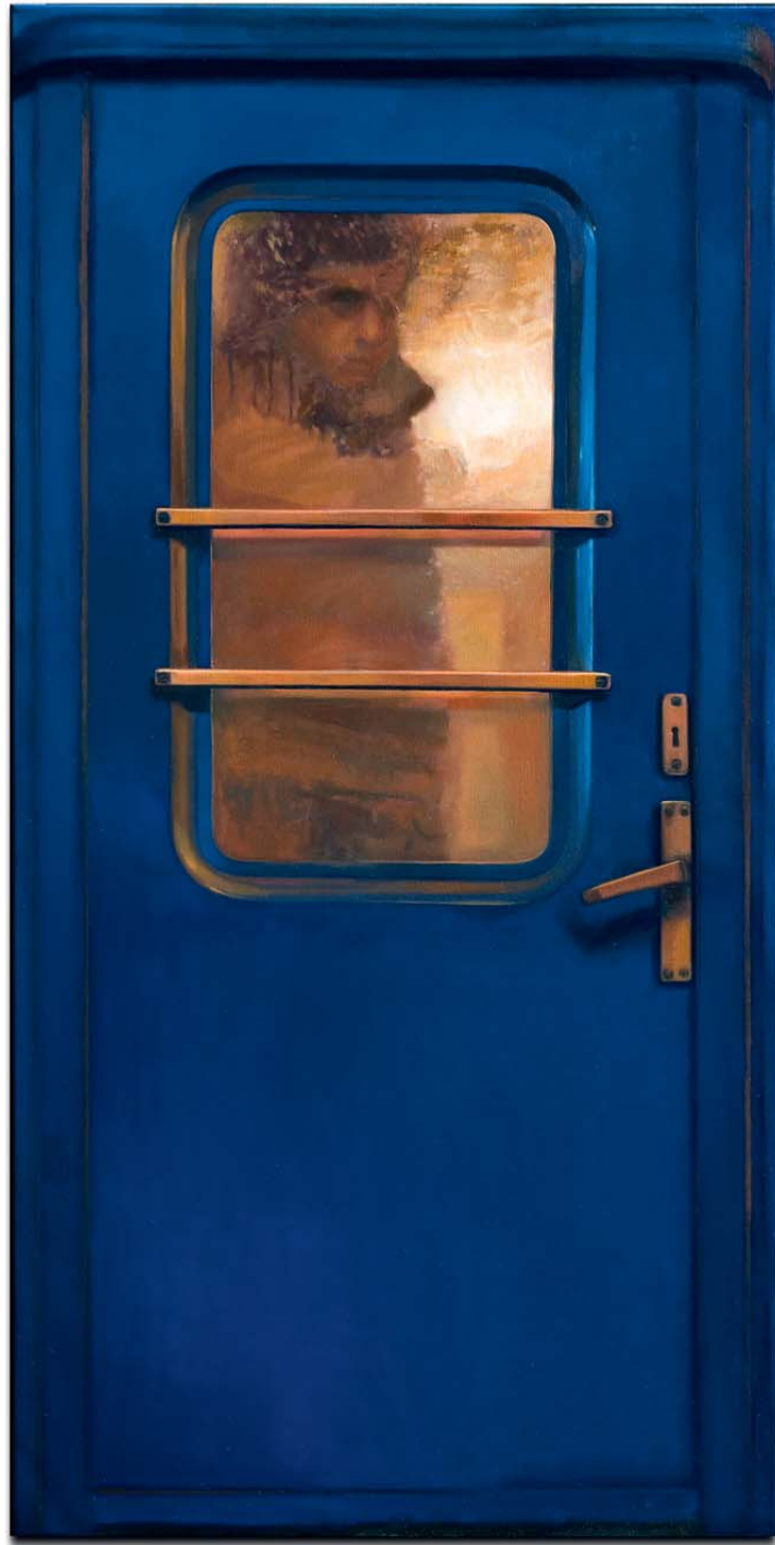
"Wagon G", 2009 oil on canvas 71 x 35 1/2 inches (180 x 90 cm)