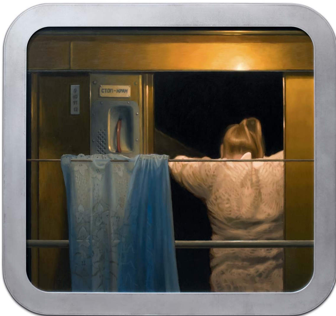
"H - 256/6" , 2009 oil on dibond, aluminium frame 40 1/8 x 43 inches (102 x 109 cm)