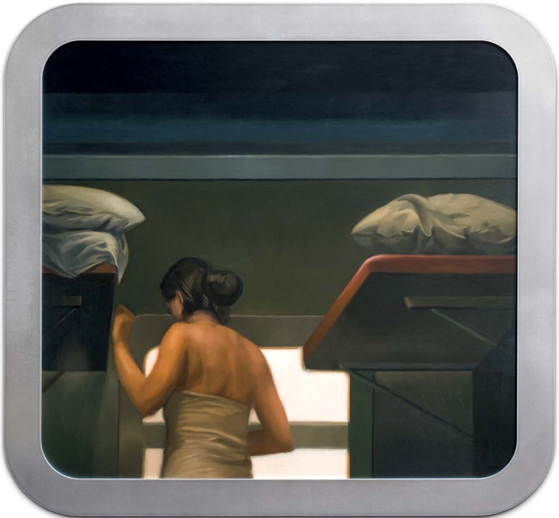
"K - 183/8" , 2009 oil on dibond, aluminium frame 40 1/8 x 43 inches (102 x 109 cm)