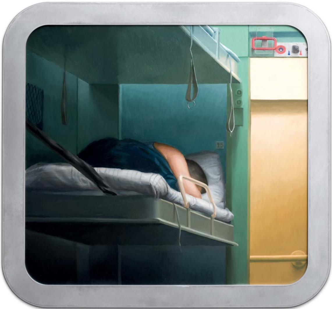
"G - 182/10" , 2009 oil on dibond, aluminium frame 40 1/8 x 43 inches (102 x 109 cm)